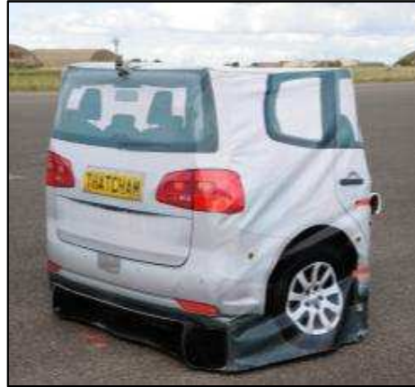
Figure 1 – Euro NCAP Vehicle Target (EVT)

The car target used for the AEB tests shall have the appropriate radar and light reflective and visual signature of that of a real vehicle, equivalent to that of the Euro NCAP Vehicle Target (EVT) as described in Annex A of the Euro NCAP Test Protocol – AEB systems ( http://www.euroncap.com/files/AEB-Test-Protocol---v1.0---0-84f3008e-1e2e-4ee5-8e7b-186363aec79c.pdf ) as shown in Figure 1.